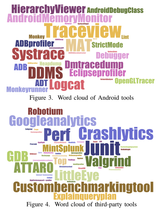
Fig 4 depicts the third-party tools used by the participants. In 54 answers mentioning third-party tools, we found 47 different tools mostly used for profiling, monitoring, debugging, and testing purposes. However, the set of tools in responses

was diverse enough in that 34 participants mentioned a unique tool that was not utilized by any other participant. The top most prevalent third-party tools are JUnit (4), Perf (4), Crashlytics (4), Valgrind/Callgrind (4), and LittleEye (3).