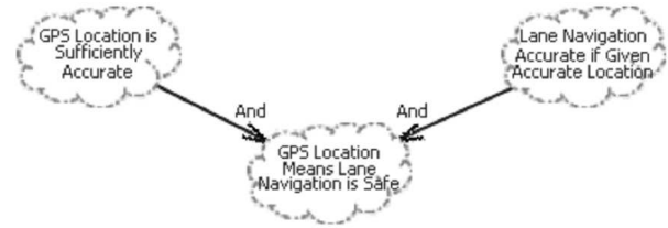
Figure 2: Simple Claim Refinement Model

in a claim refinement model. The refinement model for the example is depicted in Figure 2.