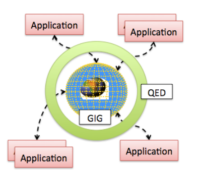
Figure 3. QED in the Context of the GIG Infrastructure and Its Applications

Section 3 describes a case study of a service-oriented enterprise distributed system that motivates the need for system execution modeling (SEM) tools for domain analysis of computational attributes and their effects on performance. This case study focuses on the multistage workflow application from the QoS-Enable Dissemination (QED) project [Loyall:09], which is a multi-team collaborative effort aimed at developing QoS-enabled middleware for the Global Information Grid (GIG) infrastructure and applications. Figure 3 shows QED in the context of the GIG infrastructure and its applications.