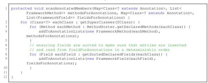
Fig. 4. Code snippets correctly classified as "readable" only when relying on textual features and missed by the competitive techniques

Summary for \mathbf{RQ}_1 . A code readability model solely relying on textual features exhibits a high degree of complementarity with models mainly exploiting structural feature. On average, the readability of 12%-21% code snippets is correctly assessed only when using textual features.