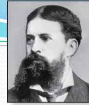
Charles Peirce (1839-1914)